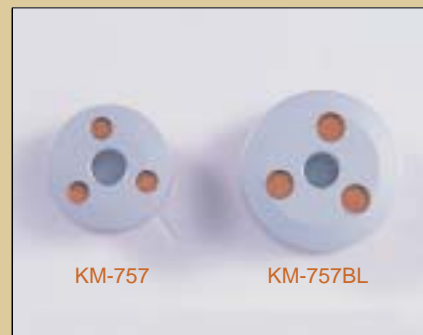
Large hook installation

Owing to the fitting of a large hook, double quantity of lower threads can be secured promoting work efficiency (BL type) compared to normal hook.