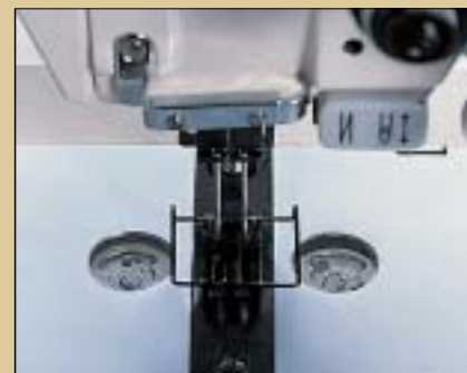
Convenient bobbin thread check system

The thread adjusting device is able to control the tension of left and right upper threads separately. In any condition, clean and high-quality sewing is guaranteed.