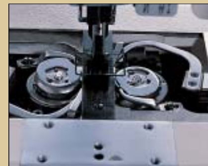
Thread trimming Mes structured for high reliability and wide operating periphery

Thread remaining in the bobbin can be verified easily through inspection windows installed on the left and right sides of each board.