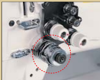
Separated adjustment of left and right thread tension

Synchronizer installed in pulley is more simple and adjusted easily. (KM-757(BL)-7S)